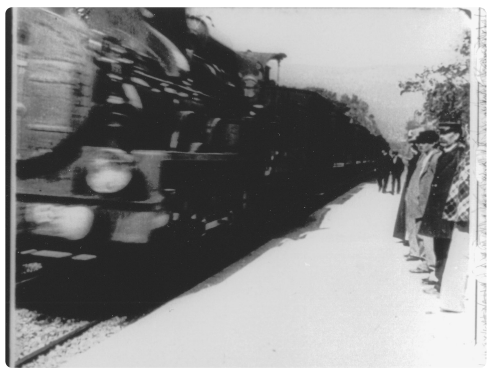
A clear sign indicating that we are dealing with a staging of the profilmic scene is provided by the be-